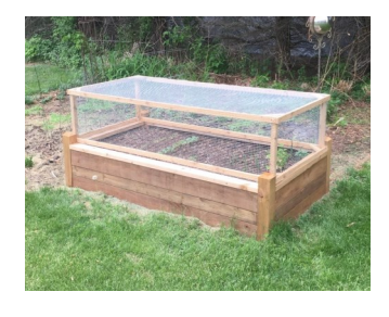
Built a garden box with a hinged deer and rabbit proof cover