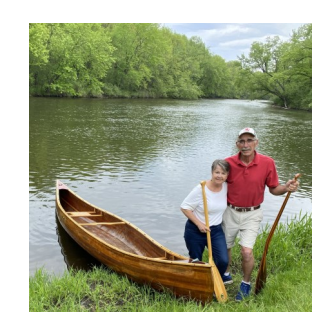
Refurbished my 26year-old wood strip canoe