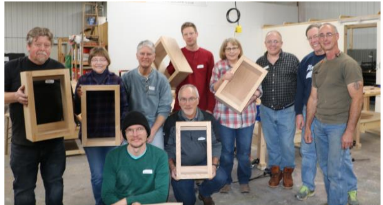
February 3 Class