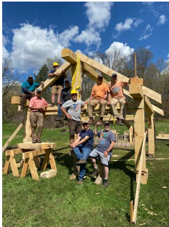
This structure was built by the 2022 class, and it now resides on the Lake Wobegon Trail in Albany. It's a bike shelter.

He employs a wild array of modern and ancient tools, and he's a great storyteller.