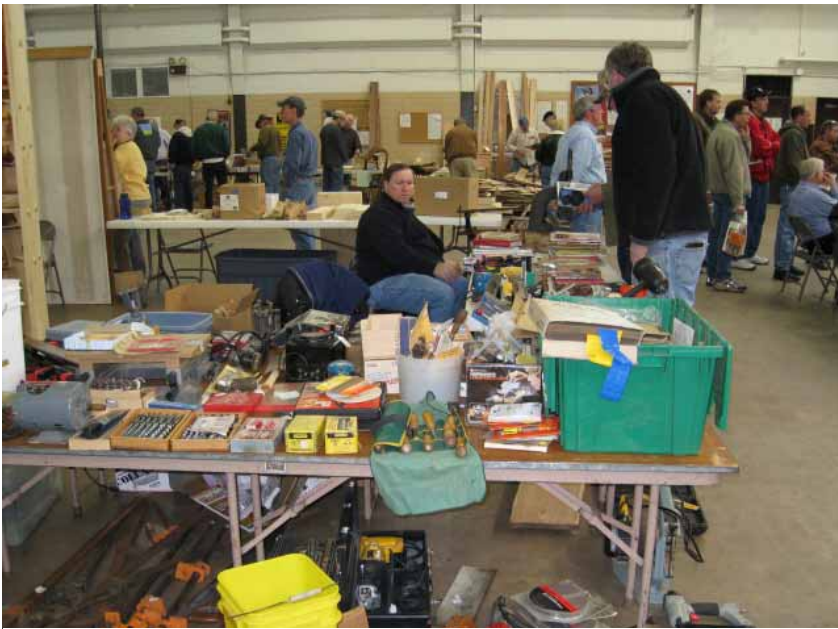
The Expo drew 17 vendors with a variety of services and wares.

The CMWA sponsored Wood Expo was a great show this year.