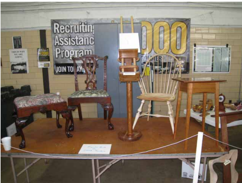
CMWA members had a very nice display of projects.

The grand prize for the show was a Wilton Oscillating Spindle Sander and it went to Brad Forbrook of St. Cloud.